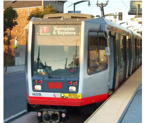
The Central Subway will extend Muni's T Third Line.