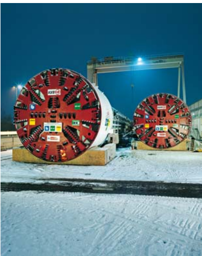
Tunnel boring machines like the two shown here will excavate the tunnel.