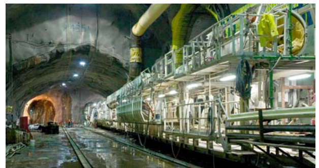
Tunneling will start at an excavation site called a launch box. Pictured here is the launch box for New York City's Second Avenue Subway.